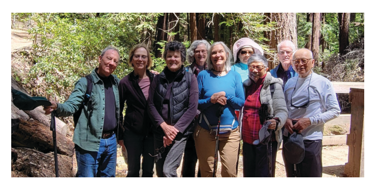
A Pick-A-Party hike at Huddart Park in April brought this group together under the trees