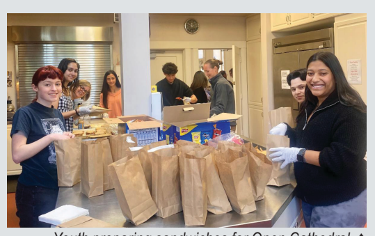
Youth preparing sandwiches for Open Cathedral ↑ 60 Minutes Youth Discussion Group →

Contact jessica@ccsm-ucc.org for registration link and paperwork