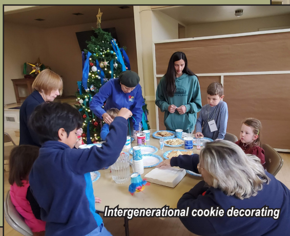
Intergenerational cookie decorating