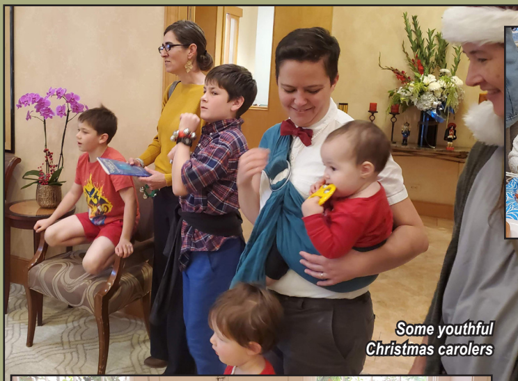
Some youthful Christmas carolers