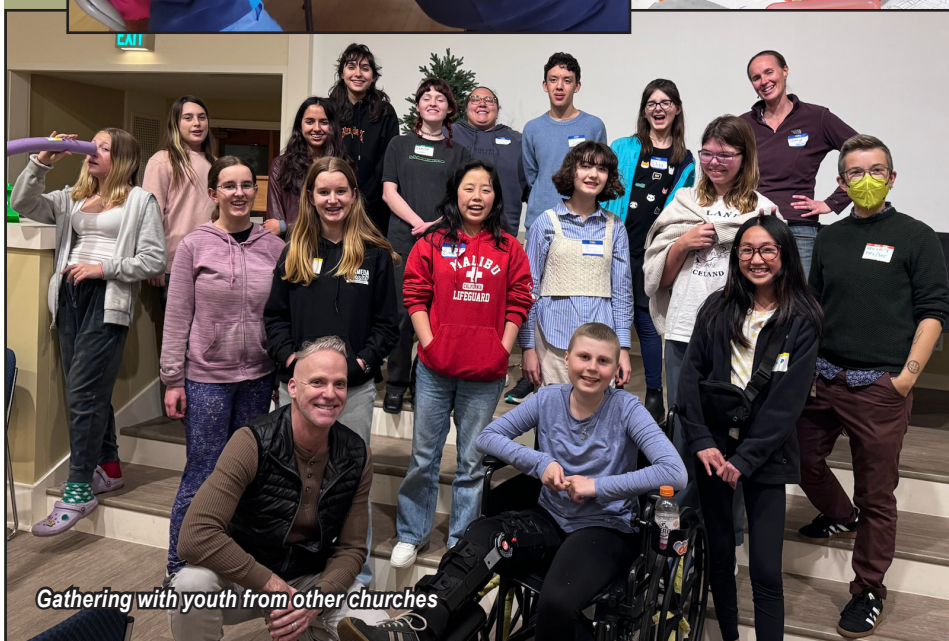
Gathering with youth from other churches