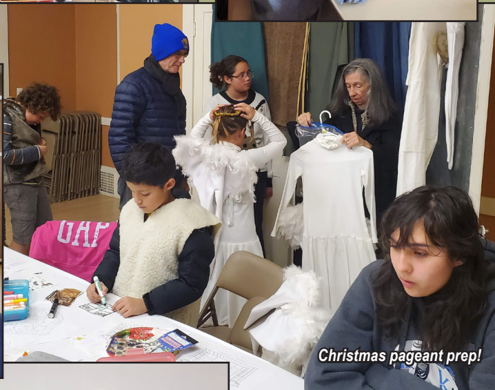
Christmas pageant prep!