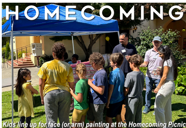
Kids line up for face (or arm) painting at the Homecoming Picnic