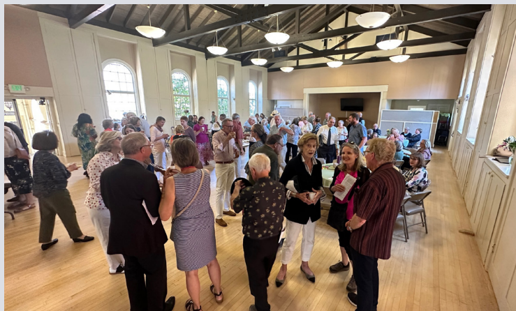
Kloss Hall during Coffee Hour on August 13

your computer to the monitor, special bowls/cutlery, coffee/tea set up, ice water, extra chairs, access to the church if you don't have a key, etc.)