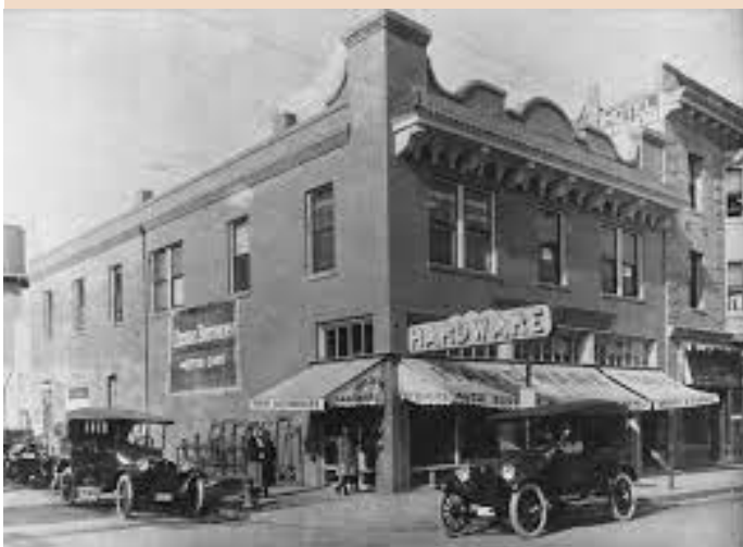
<<Original Wisnom's Hardware, Second & Ellsworth, 1905 >>Wisnom's at First & Delaware