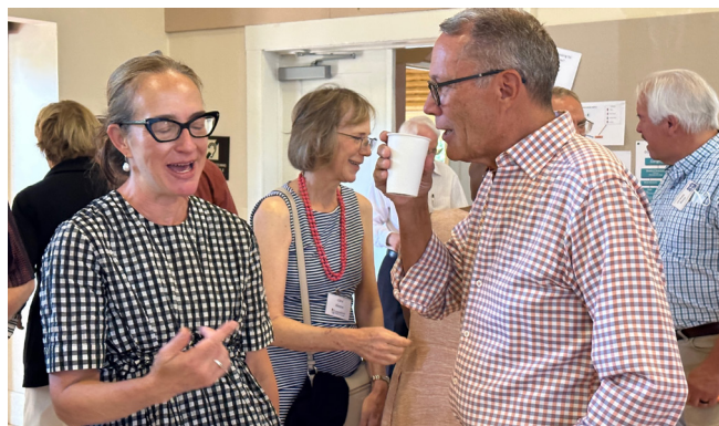
This photo from Coffee Hour on August 13, 2023, captured the ways CCSM members harmonize commonalities and differences... check out the variety of stripes, checks, and plaid!