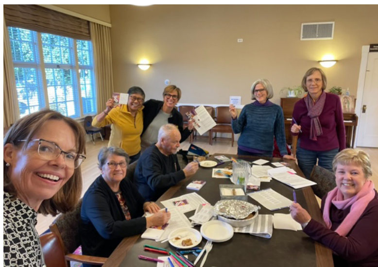
Writing postcards for "Get Out the Vote" in November