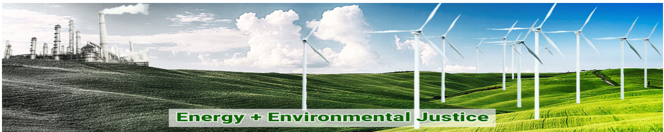
Energy + Environmental Justice