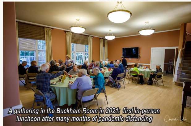
A gathering in the Buckham Room in 2021: first in-person luncheon after many months of pandemic distancing

“The Congregational Church of San Mateo renews its welcome to the Japanese Union Church. We pledge ourselves to keep unbroken the bond of Christian fellowship with your church.”