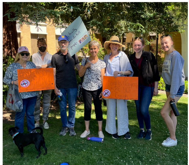
This group of CCSMers joined the March for Our Lives rally in Burlingame on June 11, 2022