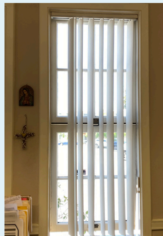
The mystery of the missing blind...