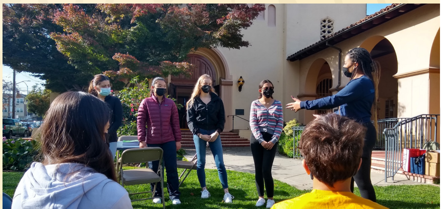
Guests from SafeSpace SanMateo sharing about youth mental health