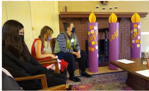
CCSM Kids Advent Program

pressure. Service projects have also continued to be an important part of our programming with this group and it is very much connected to the theme of supporting mental health by serving others as a way to also support individual and collective wellness.