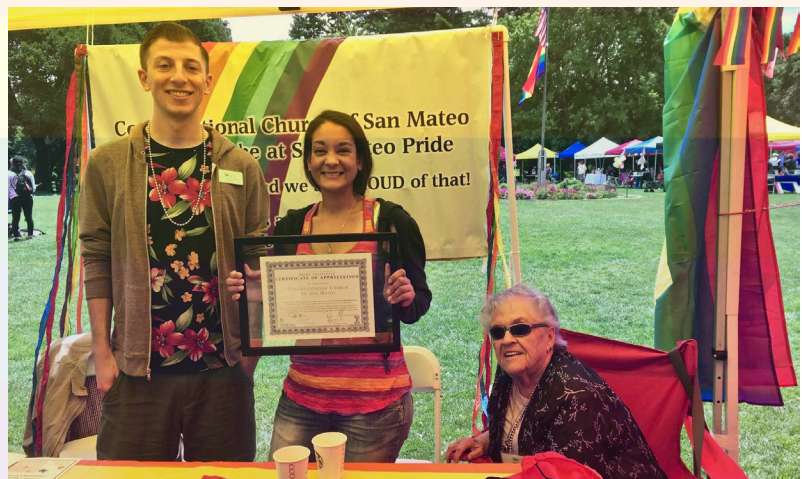
Certificate of Appreciation at San Mateo Pride

We were thrilled to receive a Certificate of Appreciation for our on-going sponsorship and support.