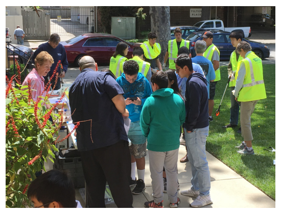
On April 28, CCSM became God's hands and feet as they participated in Team Up to Clean Up in our local neighborhood!