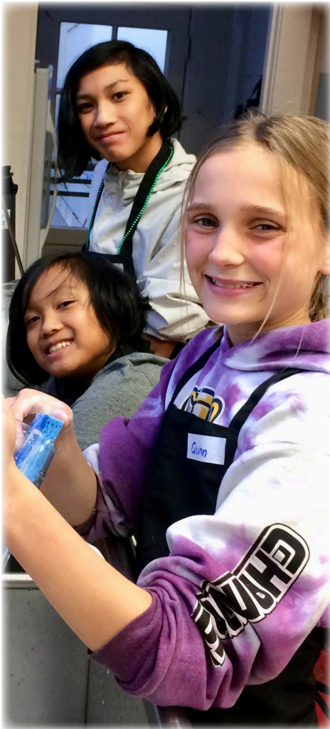
Our cheerful and capable youth served over 70 people for Shrove Tuesday Pancake Supper!