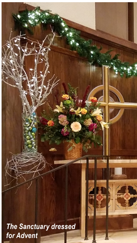
The Sanctuary dressed for Advent