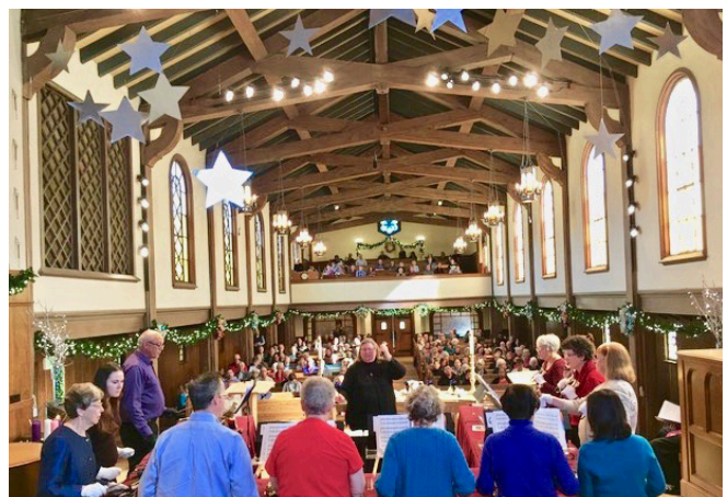
The Carillon Bell Choir's perspective of the sanctuary decked out for the season on the first Sunday of Advent