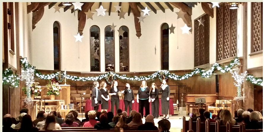
The Solstice concert took place just after the sanctuary was decorated for Advent