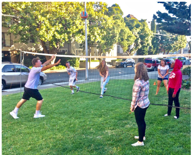
Church lawn transformed by the High Schoolers. Can you find the volleyball?