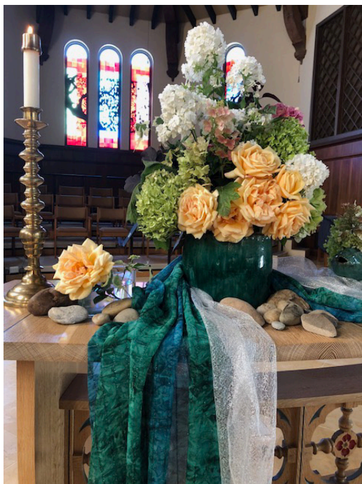
A beautiful altar created by the Liturgical Arts team in August, evoking water