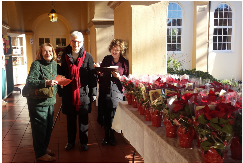
All these poinsettias were brought to CCSM members who have been bereaved or are unable to get out. Many cheerful deliveries were made on December 3.