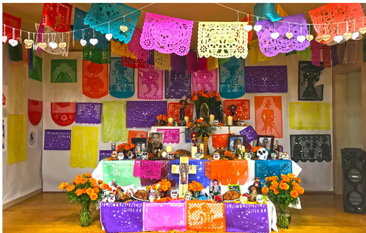
Altar from Dia de los Muertos, October 2017