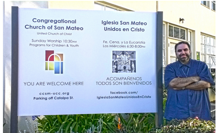
The new sign at the corner of Tilton and Ellsworth which now includes Iglesia San Mateo