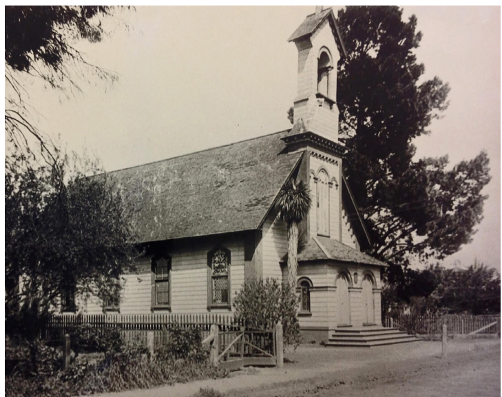
Original pre-1906 earthquake building with our pine tree, on the corner of Tilton and San Mateo Drive, facing south