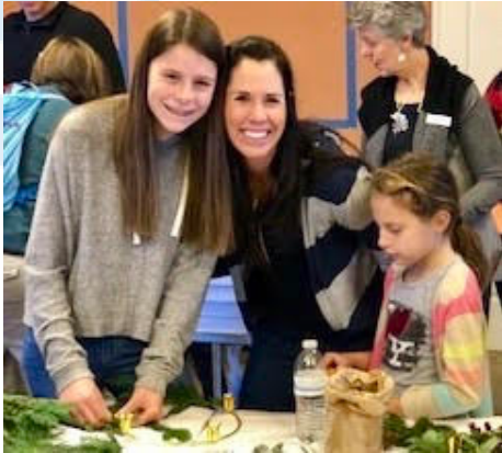
The Verduccis creating a special Advent wreath