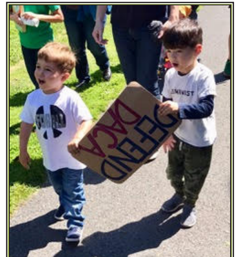
In spite of the alt-right not showing up, CCSM members joined marches in Berkeley and San Francisco for peace and justice.