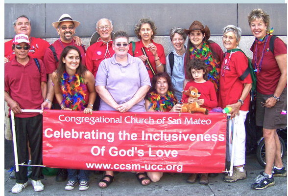
CCSM representing at the Pride Parade back in 2009.

So come out and join your friends and family at our 5th annual event! Be sure and look for the CCSM table and banner among the supporting organizations.