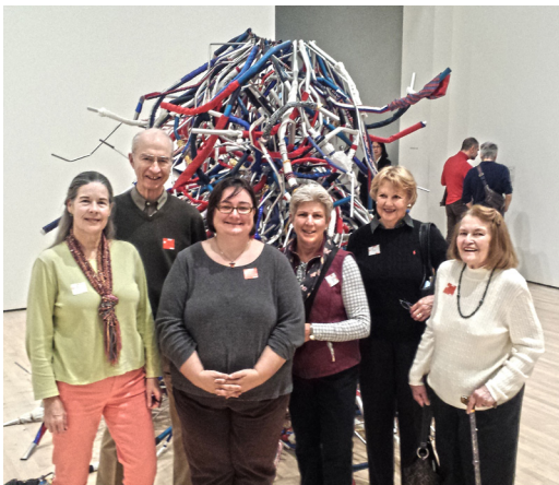
Wise & Wonderful Ones at MOMA