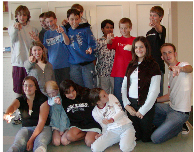
CCSM Mid Highers in 2006... and a current staff member