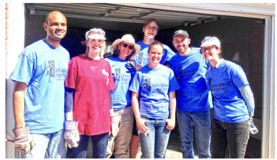
The 2016 Rebuilding Together group