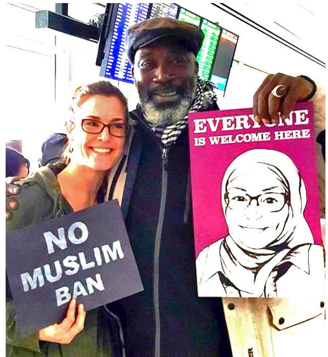
CCSM represents at the spontaneous protest at the San Francisco Airport in response to the Muslim travel ban.

(Our “Second Hour” event originally scheduled for that Sunday, a showing of the documentary “13th,” will be rescheduled for another date.)