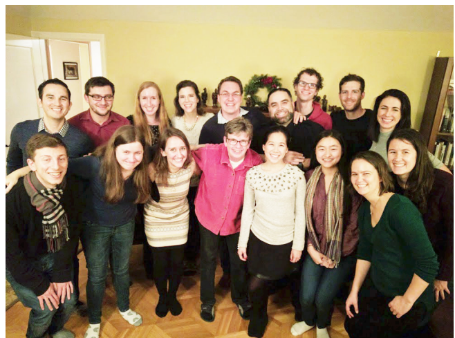
The 20s/30s group enjoying fellowship together