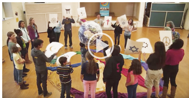
Click to play video ( tinyurl.com/peace-vil-video )