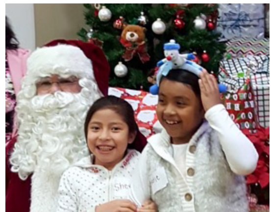
Girls giggle with Santa at the party we helped host Wednesday for unaccompanied minors from Central America. Festivities included a feast, live band, games, lots of presents, and photos with Santa. What a celebration with these brave children!