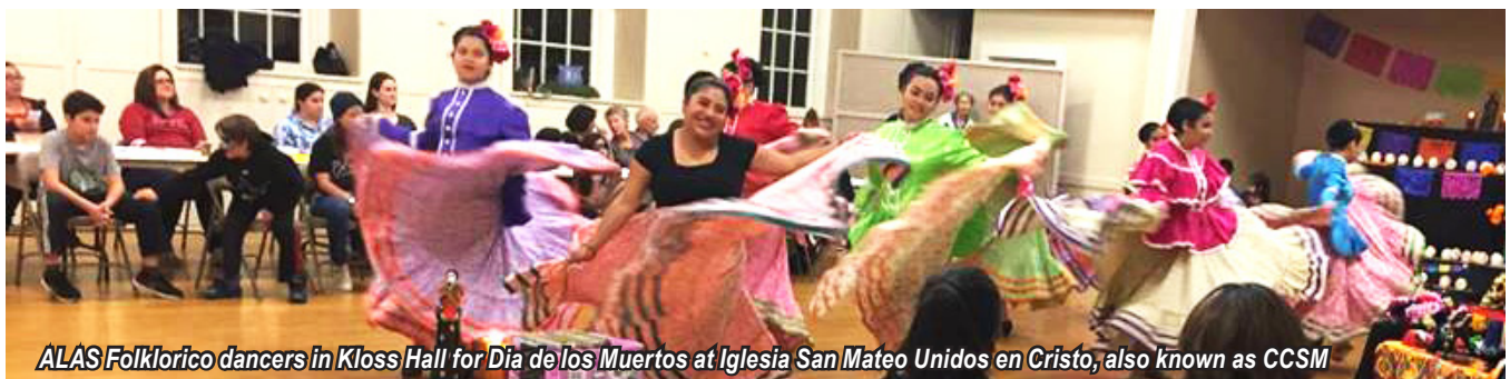
ALAS Folklorico dancers in Kloss Hall for Dia de los Muertos at Iglesia San Mateo Unidos en Cristo, also known as CCSM