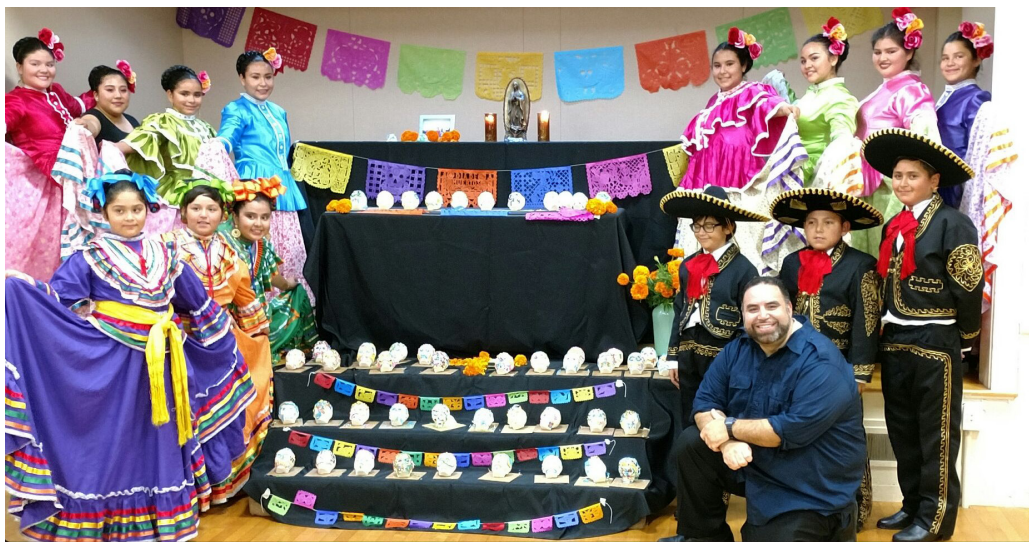
CCSM's Dia de los Muertos celebration with the ALAS dancers from Half Moon Bay