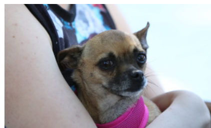
A visitor to CCSM's Community Day last June

I'm here for you in the office every Monday. Please feel free to communicate with me if I can be of service to you.