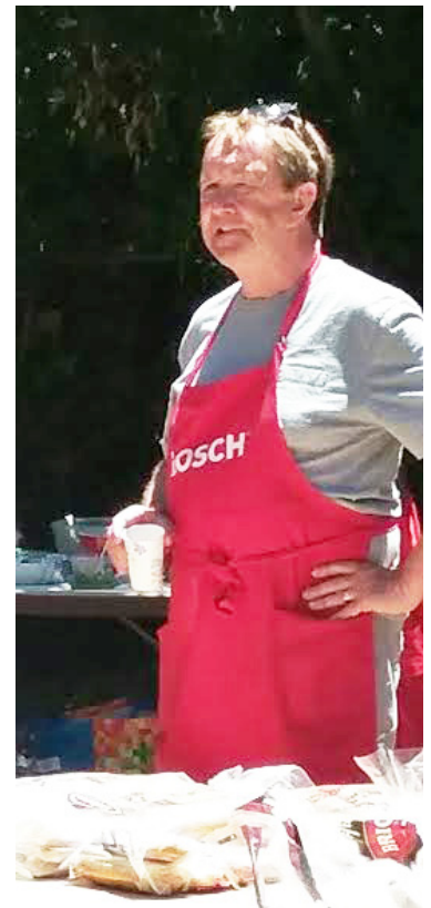
Satisfaction at the 2016 CCSM Church Picnic