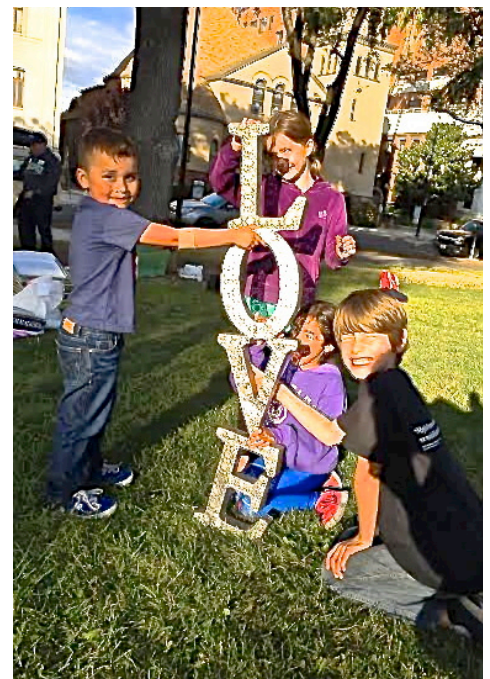
Kids at SVVFC building love