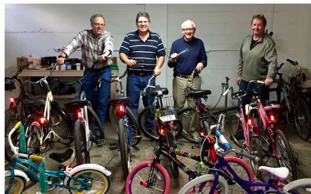
These are four of the seven Tool Men on the Wheels Team who worked on donated bicycles in the new space at the Masonic Temple. In one day they rolled out a dozen bikes for farmworkers on the coast (including four small bikes for children).