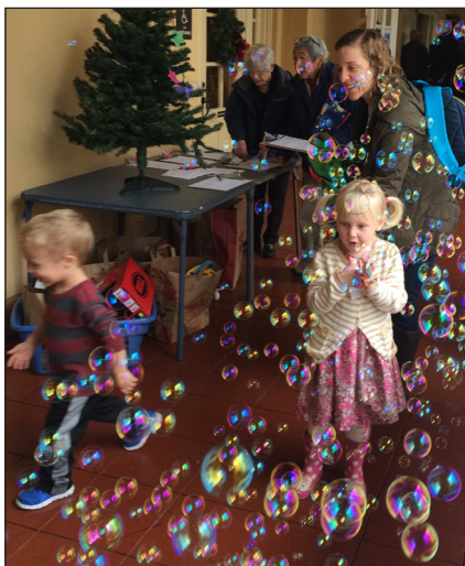
Fun was had at the Parent Kid Hangout in December