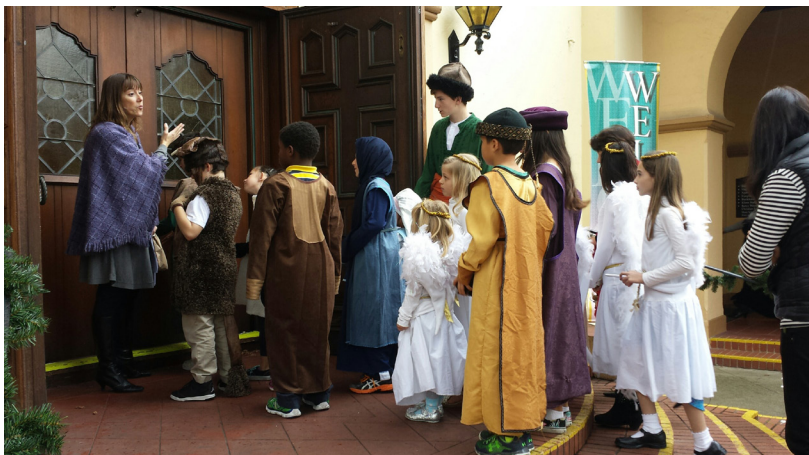
Our pageant participants preparing to enter the Story...