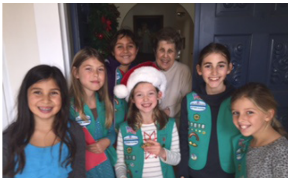
Girl Scouts caroling for CCSM members