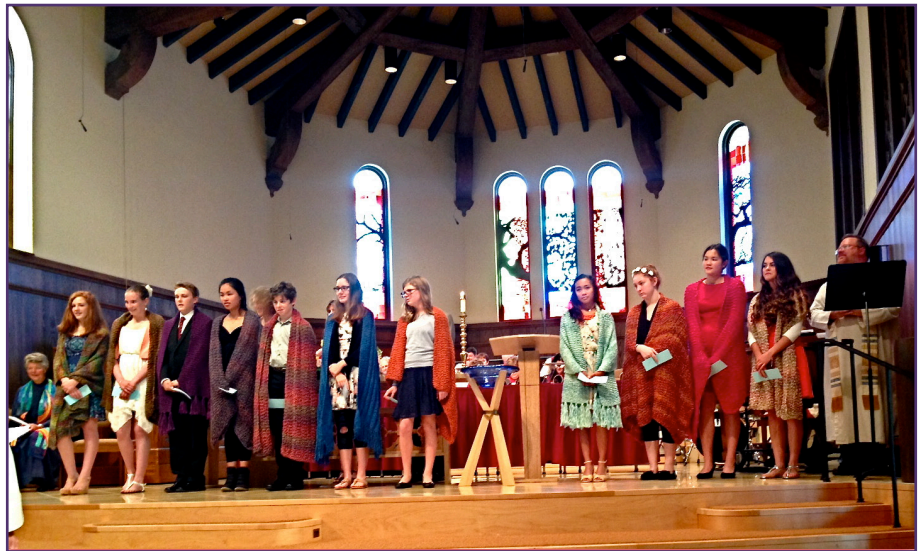
The Confirmation Class joining the church on May 17, 2015