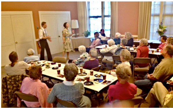
Hillbarn Theatre actors presenting scenes from "Curtains," at the Music and Arts Guild luncheon April 17.