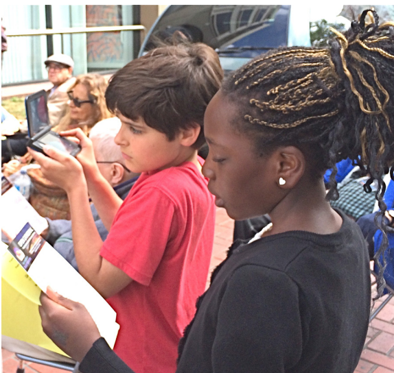
Worshipping at Open Cathedral, SF Night Ministry's service for the homeless