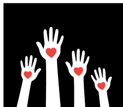
Ministry of Service & Justice

Now you can use CCSM-UCC.org to keep up with the latest opportunities to participate in our ministry to the community. On the website, click “Service and Justice” in the left column to see remarkable educational events, volunteer possibilities, material donations needed by our partner service agencies, and future service-learning experiences like the recent trip to Las Memorias in Tijuana.