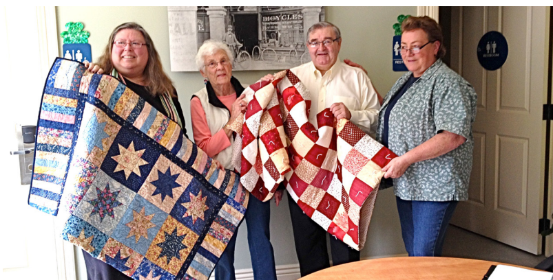
Some Blanketeers with quilts they made for Vendome residents.

Sadly, a serious factor may be people moving out of the county because it is so expensive to live here. Clearly more work must be done on local affordable housing, so our neighbors won't be forced into homelessness—or out of the county. This summer To discuss the issue and possible solutions, CCSM will sponsor an affordable housing forum with our County Supervisors, HIP, HEART, and other housing advocates.