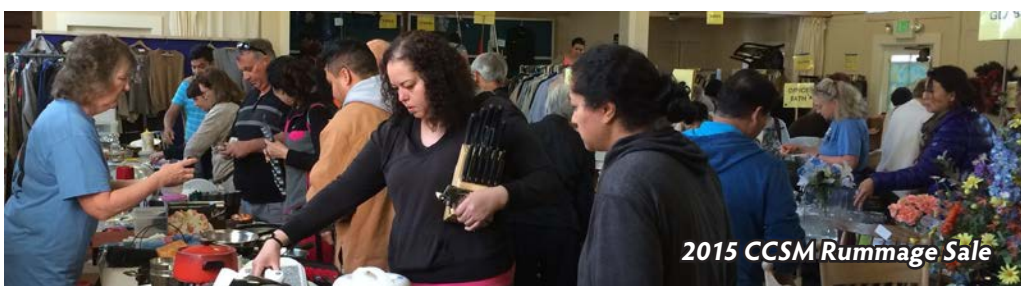
2015 CCSM Rummage Sale