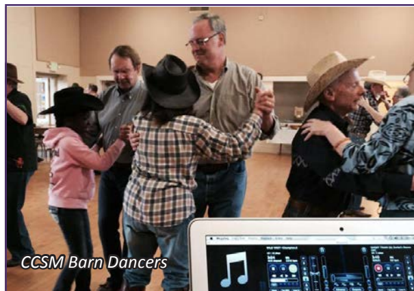
CCSM Barn Dancers

Swing your partner! Some boot-stomping fun was had at last month's Barn Dance Pick A Party.