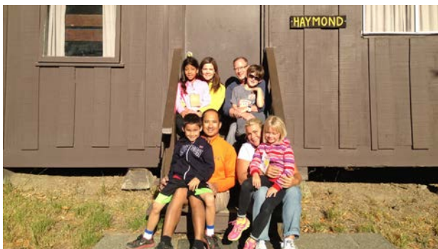
You and Me Camp Caz, July 2014