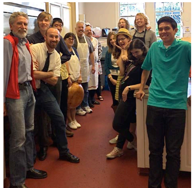
Costa Rica Mission Team 2015