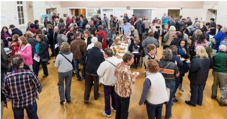
Lively reception in Kloss Hall