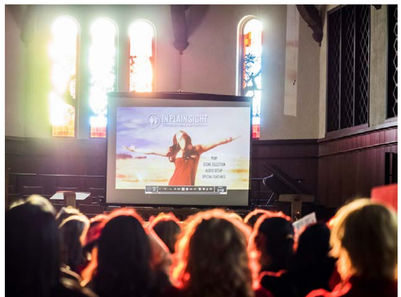
Screening the film in the sanctuary

We need your help to grow the Prayer Ministry. We need more people to pray after service with others in our church. Join us; refresh your own prayer practice and lend a hand to others who need an extra kind word. Please come and bring a friend.