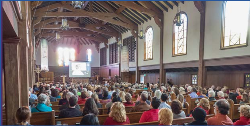
Screening of "In Plain Sight" anti-human-trafficking film on Jan. 11. See full story on p. 5