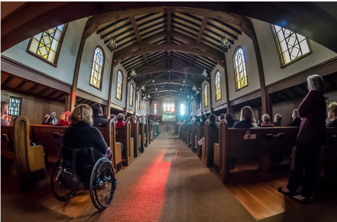
A beautiful view of our sanctuary as a packed house viewed the anti-human trafficking film "In Plain Sight" on January 11.

Anyone wishing a copy of the final 2014 financial results or the 2015 budget can request one from the church office. Thanks again for making 2014 so successful.