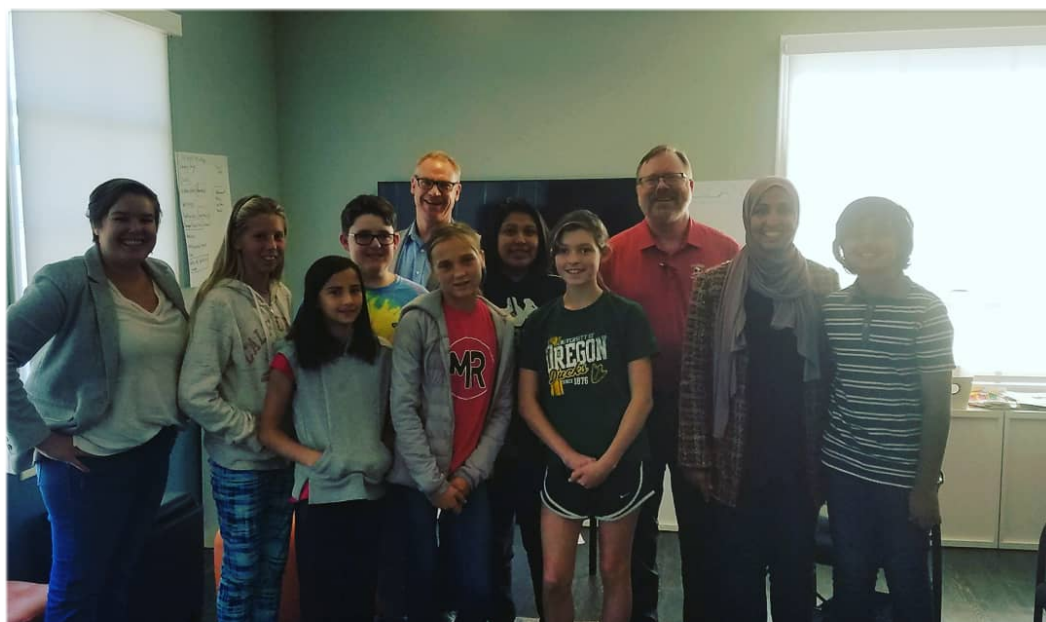
Guest speakers sharing about Islam with the Sunday youth discussion class

CCSM's Children, Youth, and Family Newsletter