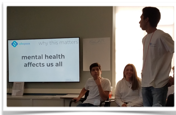
Youth Presenters from Safe Space San Mateo