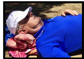
↑ Wiped-out chaperone

Workshops, service projects, Pearl Harbor, new friendships, Polynesian Cultural Center, Missionary Houses and more! For years, our youth will be telling stories about their fascinating, fun trip to the UCC Western Regional Youth Event on Oahu. They represented us well; the worship service they led received a standing ovation! Many thanks to all of you who helped make this trip possible!