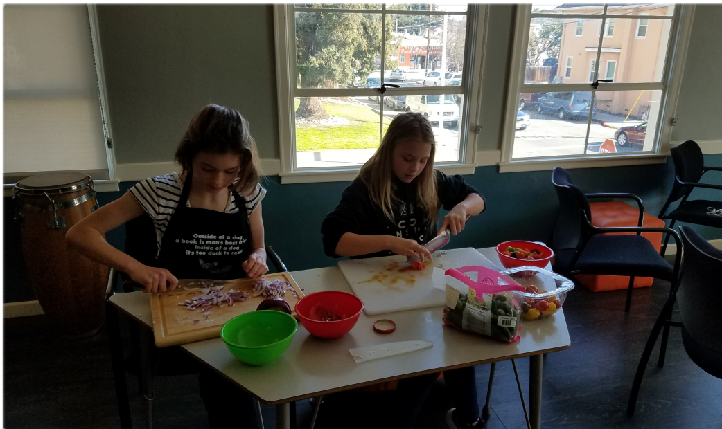
CCSM Youth Preparing Dinner for Hope and Hope Family Shelter

CCSM's Children, Youth, and Family Newsletter